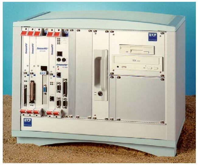
CR7-XX-RACK (Custom Specific)

Additional options and ordering numbers see product information CD1-OPERA and CD2-BEBOP