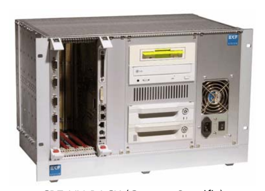
CR7-XX-RACK (Custom Specific)