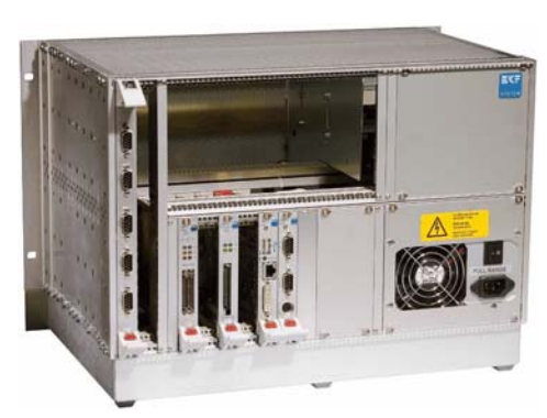
CR7-XX-RACK (Custom Specific)